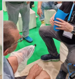
8) ready socket/negative