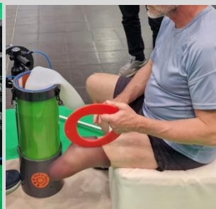
2) choose stencil size