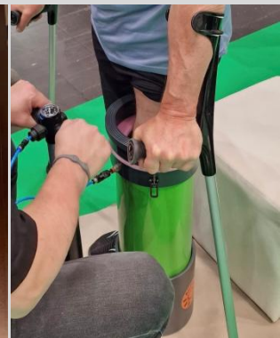
4) assemble and test dry