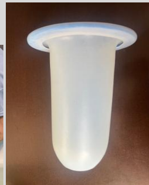
3) adjust membrane