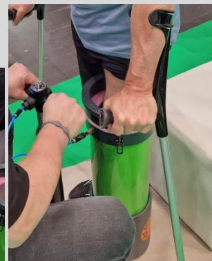
7) pump up and load