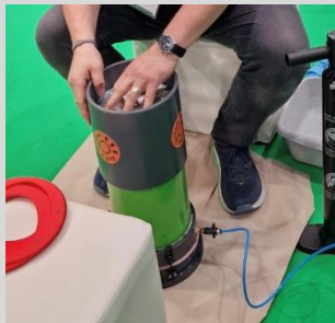
1) turn and set height