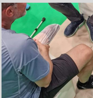
5) prepare stump